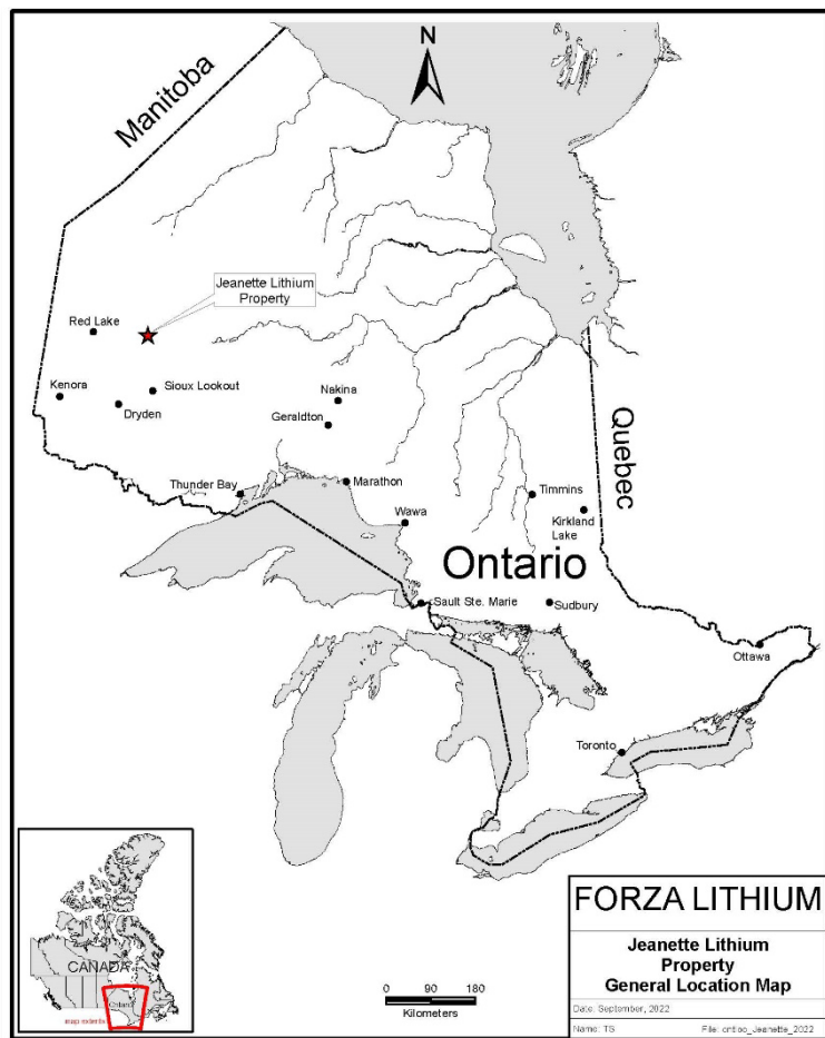
Figure 1: Location map of the Jeanette Property, northwestern Ontario.

The overall Property covers an area of approximately 1,825 hectares. The most accessible route to the Property is traveling north to Ear Falls from Vermillion Bay, for approximately 106 km along Provincial Highway 105 that connects with the Trans-Canada Highway 17 at Vermillion Bay, Ontario. Then east at the junction between Provincial Highway 105 and 657 in Ear Falls, a Domtar maintained logging road turns north off of Hwy 657 on the left, which provide access to the Property along an all-weather gravel road for an additional 95 km. Several secondary logging roads transect several of the claims of the Property.