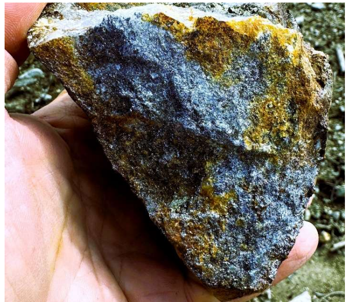
Sample A0284675 showing Molybdenite covered fracture