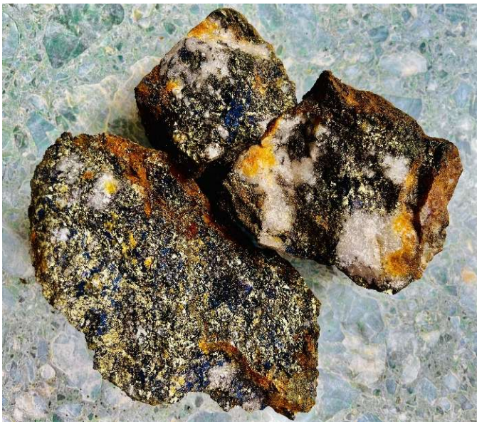
Sample A0284675 with coarse Chalcopyrite and Chalcocite

The results of the hyperspectral analysis and field observations indicate a well defined alteration zonation with a central zone covering the location of a number of the historic drill holes. The potassic central area that is indicative of a higher temperature core of a porphyry system was determined by field observations, while the argillic, propylitic, and smectite alteration halos were defined by TerraSpec 3 analysis (Figure 3).