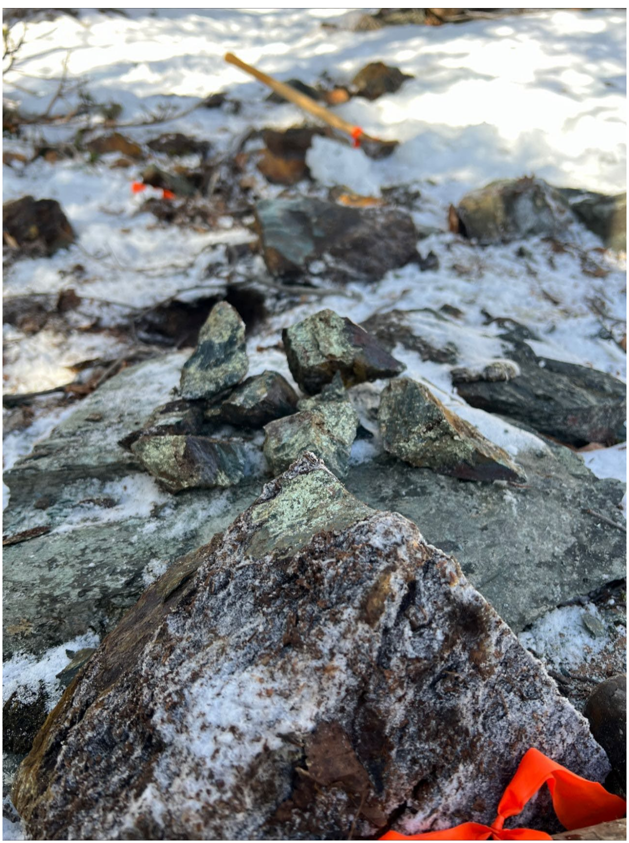
Figure 3: Semi-massive to massive sulphide mineralization located on Sorrento's newly acquired Lord Baron Project