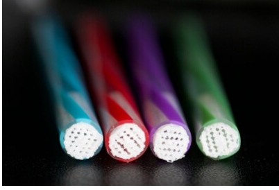
Medical Straw by StickIt Technologies