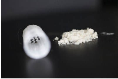
Medical Straw by StickIt Technologies

View original content to download multimedia: