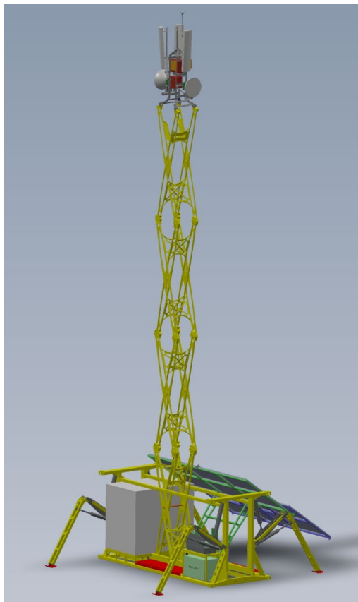
Figure 1 – Computer generated render of the SDS

CITP's SDS is a portable radio communications platform that can be easily transported and rapidly deployed, which is anticipated to allow users to provide services to remote areas. Being a platform, it can support a wide range of transmission, surveillance and other technologies. This further allows the SDS to support a wide range of market sectors and use-cases, using this standard, repeatable product. CITP's initial sector targets are expected to be the mining and resource sector, the defence sector and the emergency services sector.