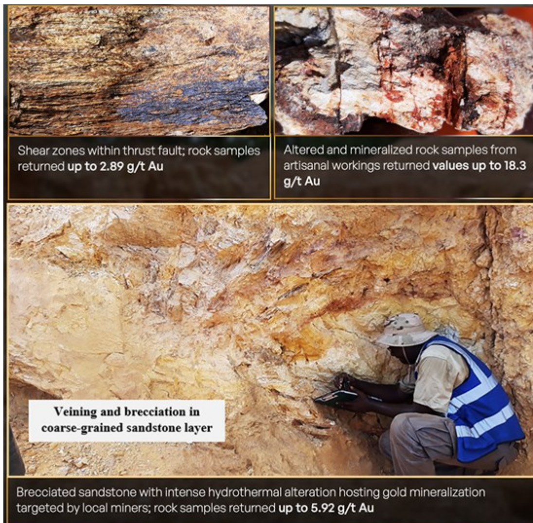
Figure 2. Bedrock gold mineralization in artisanal workings at Bantabaye.

RC drilling is expected to start in Q1 2023, following the preparation of drill sites and the mobilization of equipment.