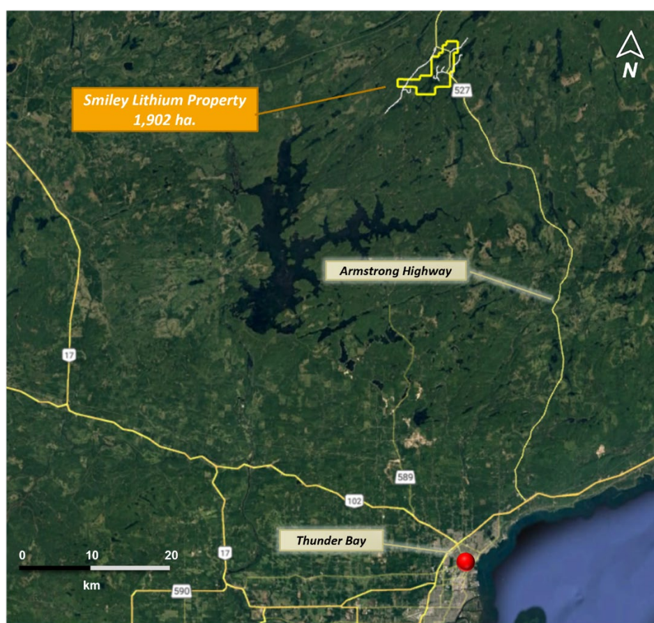
Figure 1. Regional location of the Smiley Lithium Property.

Provincial highway 527 transects the Lithium Property with excellent secondary road access with Thunder Bay providing excellent rail and port facilities.