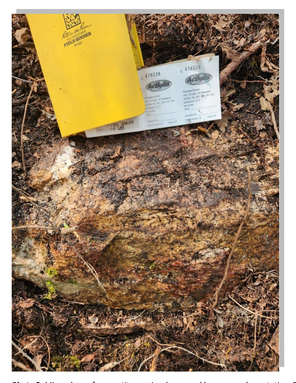
Photo 2. Mineralogy of pegmatite previously covered by moss and vegetation, Pag North property.