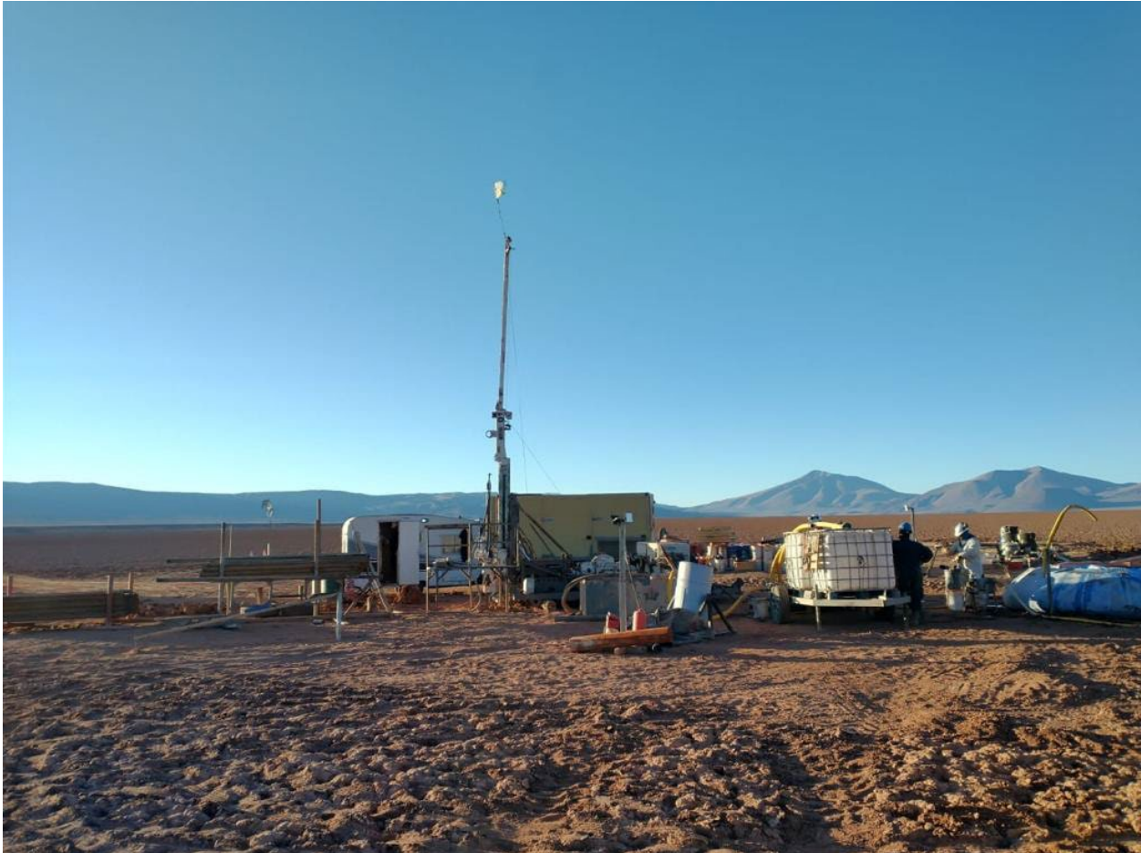
Figure 1. Drilling at Pocitos 1 Lithium Brine Project (Salta, Argentina)

sand lithologies respectively and a Mineral Resource Estimate (“MRE”) of 760,000 tonnes of Lithium Carbonate Equivalent (“LCE”) on the combined Pocitos 1 (800 Ha) and neighbouring Pocitos 2 block (532 Ha) . American Salars does not own the neighboring Pocitos 2 ground which comprises 40% of the gross land package that makes up the resource however it is notable that all drilling to date has been completed on American Salars’ Pocitos 1 block.