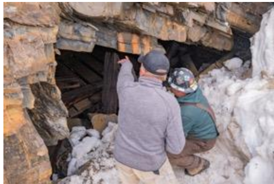
Photo 10 – Wood Timber Supporting the Roof / Back of the Adit Entrance