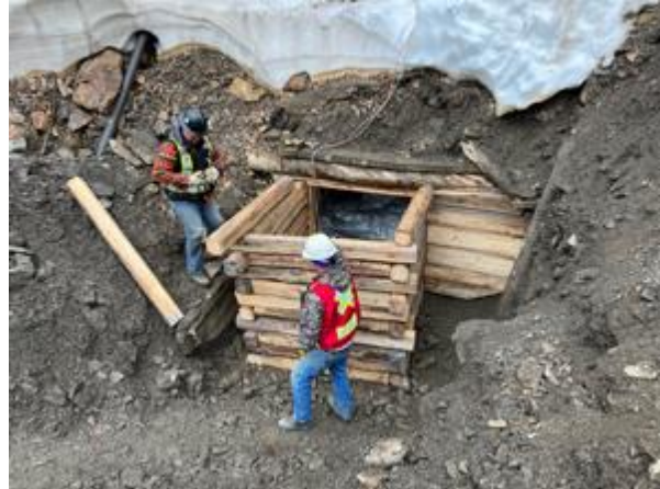
Photo 7- Final door installed on Davis Keays 6400 level.