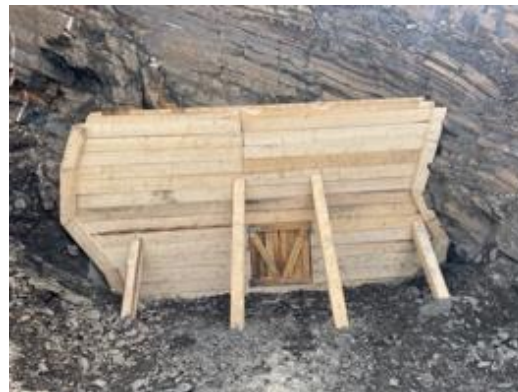
Photo 12 - Final door installed on Davis Keays 5950 level.