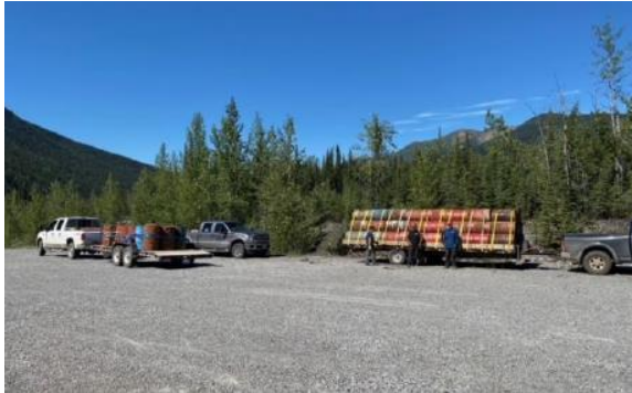
PHOTO 7 - Fuel drums were loaded onto flat deck trailers at the Mile 113 staging for transport to the Fort Nelson dump. Photo: S. Neudorf, August 2022