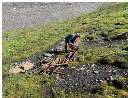
PHOTO 3 – NEBCWF crew cutting pipes for easier transport. Photo: T. Fulton, August 2022.

The legacy Gataga clean-up began on August 6, 2022. To reduce transportation costs, NEBCWF crew camped in the area for three nights while sorting waste from the identified clean-up sites into piles for transport and disposal. Wood waste was burned on site (following the regulations) and metal waste above a certain length was cut into smaller pieces for easier transport. Piles were not more than 2m x 3m at any time. (PRESS HERE for video)