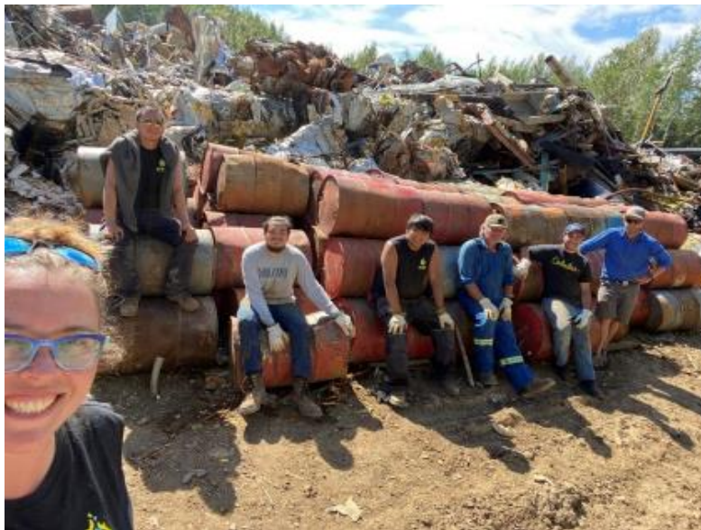
PHOTO 9 - 2,360kgs of fuel drums were removed from the Gataga River Basin to the Fort Nelson dump. Final handling crew included: SMC, NFWRx, NCPL, and Qwest. Photo: S. Leverkus, August 2022.

The type of contamination and garbage dumping that lead to the waste in the Gataga River basin should no longer be taking place in the region. In addition to wider policy change over time, companies such as project-partner Fabled Copper Corp are working diligently to ensure effective stewardship of the lands they develop. Non-profits such as WSSBC are dedicated to conserving valuable wildlife habitat in Northeast BC and it has been very effective and efficient to work in collaboration with them. As such, after the clean-up of the identified sites, we hope to focus attention in the surrounding basins and watersheds to decrease the risk of this type of pollution occurring in the area again.