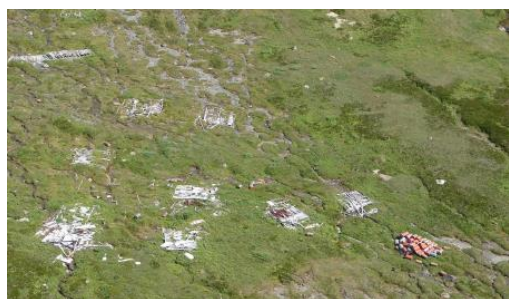
PHOTO 5 – prior to clean-up, showing abandoned fuel drums and other waste piles.

At the Mile 113 staging, NCPL, Qwest, SMC and NFWRx staff loaded waste onto trailers and trucked it to the Fort Nelson dump for disposal. See Photo's 5 & 6 for before and after clean up. Photos 7,8,9 of material removed and final crew.