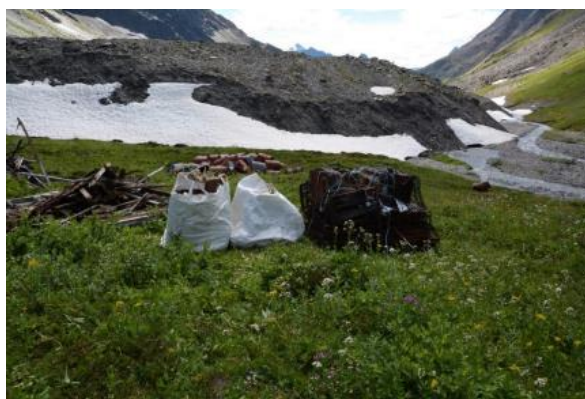
PHOTO 4 – Sorted waste ready for transport and disposal. Metal waste (R) is netted for helicopter slinging. Photo: T. Fulton, August 2022.

An AStar helicopter forwarded waste piles (PRESS HERE for video) to a central clean-up site where they were packaged and netted in preparation to be long-lined directly to the Mile 113 staging off the Alaska Highway using a larger 205 helicopter.