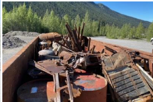
PHOTO 8 - Various waste was deposited by hand into the dumpster at the Mile 113 staging