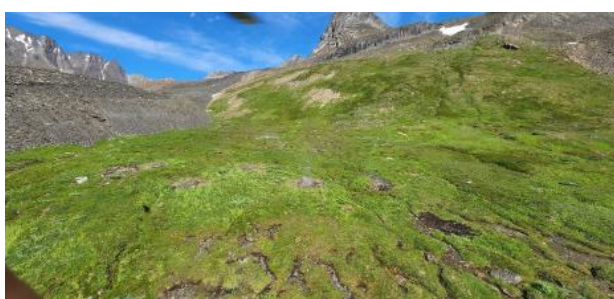
PHOTO 6 – Project area post-clean-up with previous locations of waste and burn piles