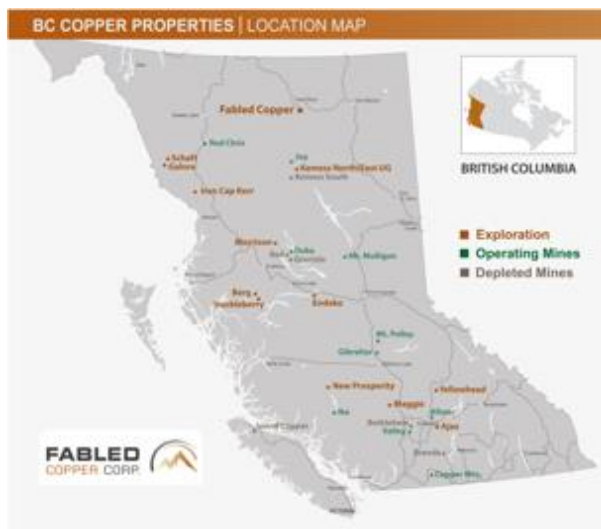
Figure 1 – General Property Location

The Muskwa Project is comprised of the Neil Property, the Toro Property and the Bronson Property located in northern British Columbia. See Figure 2 below.