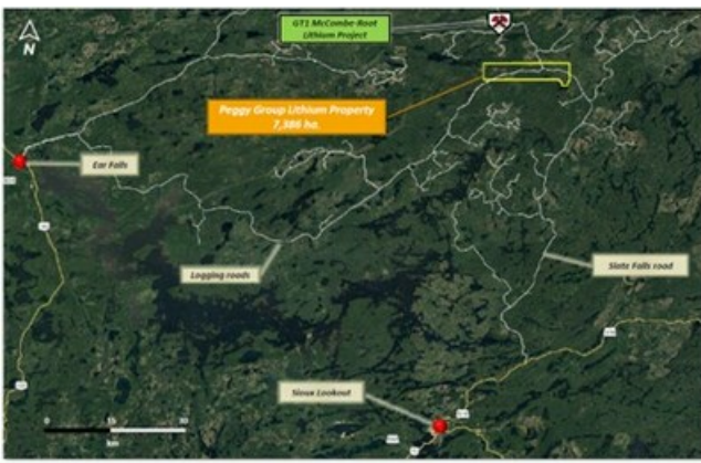
Figure 2 –Location of Peggy Group Lithium Property located North of Sioux Lookout