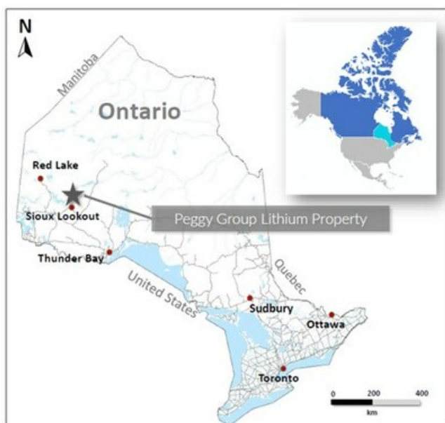
Figure 1 – Regional Location of Peggy Group Lithium Property

The Property covers approximately 7,386 hectares (73.9 km 2 ). It is located approximately 80 km north of Sioux Lookout, Ontario ( Figure 1 ), is easily accessible year-round by way of well-maintained highway and logging roads, and features good outcrop exposure. The Property is located 8 km south of the McCombe-Root Lithium project owned by Green Technology Metals (ASX: GT1), which has announced high grade lithium results from their 24,000 m drill program on the project in recent months, new spodumene bearing pegmatite dyke discoveries in the area of the project, and the commencement of baseline environmental studies, all of which highlight the importance of this emerging pegmatite field. The McCombe-Root Lithium project has a historic resource of 2.297 Mt grading 1.3% Li 2 O (Mulligan R., Geological Survey of Canada, 1965).