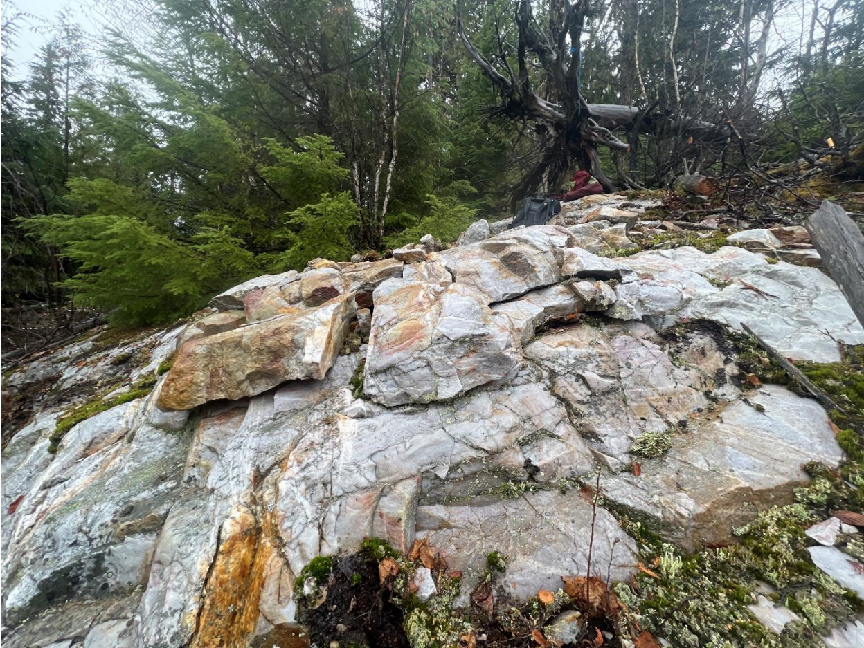
1 Quartzite member of the Yanks peak formation enriched in silica through silicification and quartz veining. Sample PT-03 returned 99.52 % SiO 2 (635883 mE 5949307 mN UTM 10N) found in the Company's Ptarmigan Silica Project 43-101 Technical Report on SEDAR.