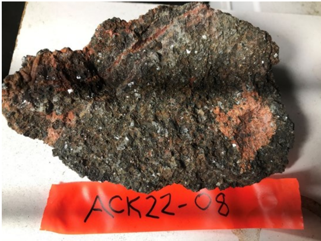
Figure 1: Massive zinnwaldite sample with remnant granite relics

To view an enhanced version of this graphic, please visit: