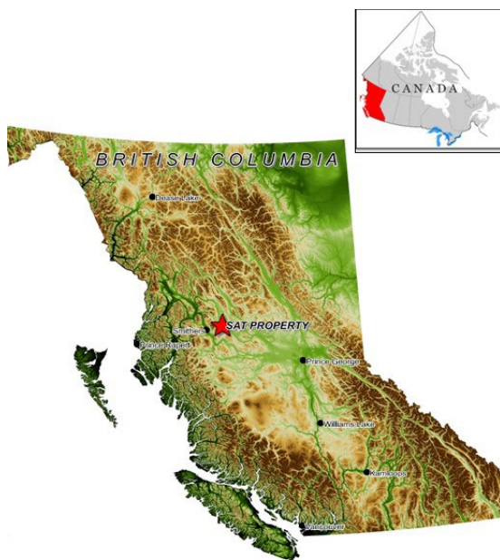
Figure 1. SAT copper property location