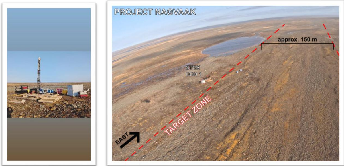
Figure 2. Diamond drill rig set up at the first target site DDH1 at Nagvaak for the 2025 drill campaign.