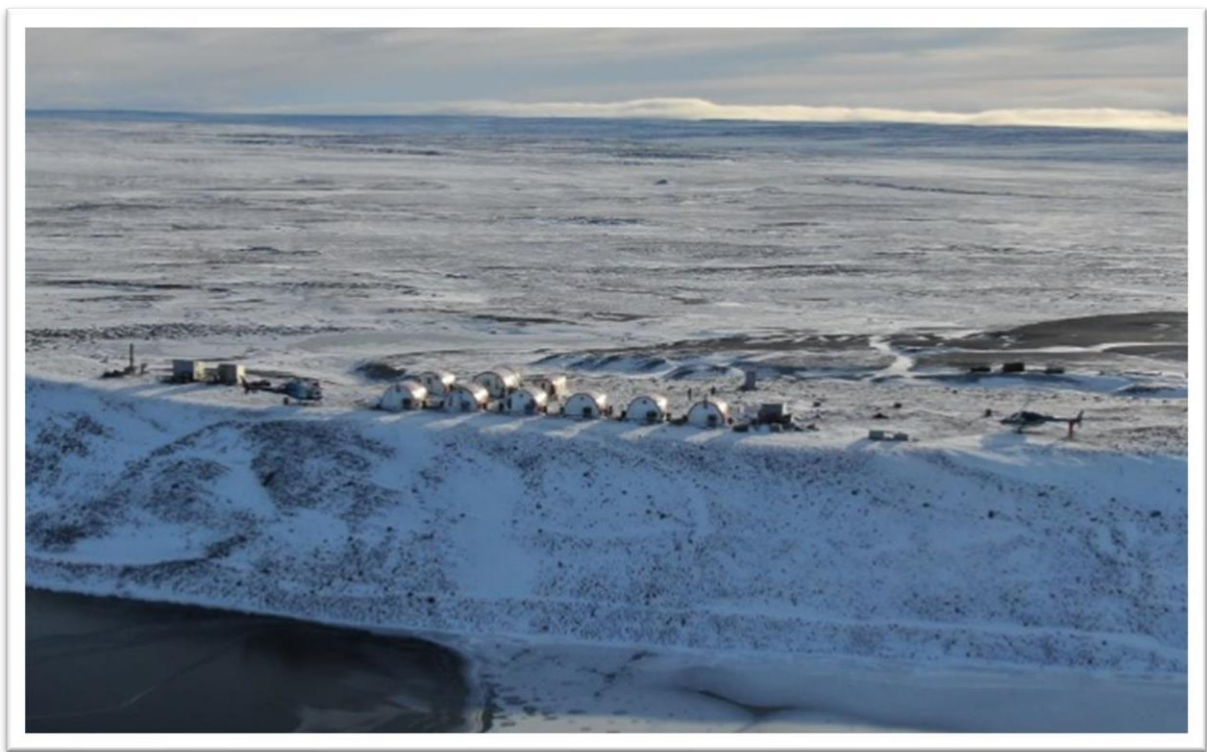
Figure 3. – StrategX's field base camp.