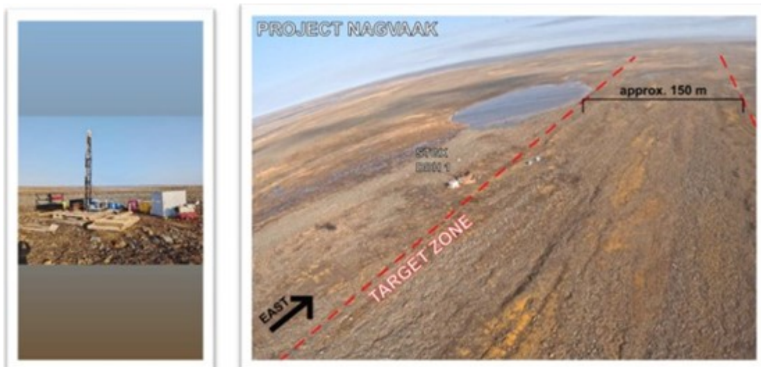
Figure 2. Diamond drill rig set up at the first target site DDH1 at Nagvaak for the 2025 drill campaign.

https://images.newsfilecorp.com/files/8512/232282_64aac6cd2489582b_006full.jpg