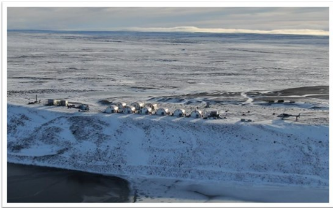
Figure 3. - StrategX's field base camp.

To view an enhanced version of this graphic, please visit: