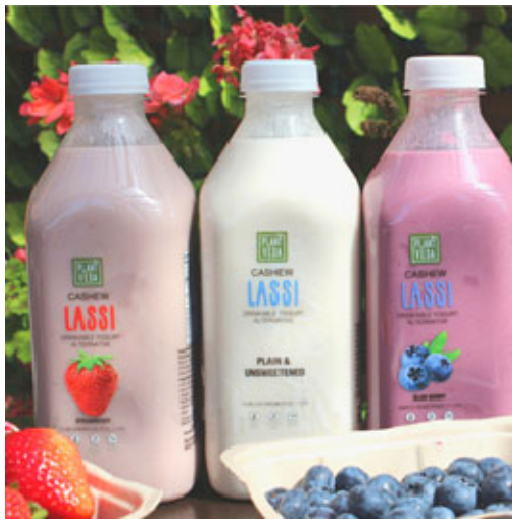
c) Cashew Milk

Plant Veda's cashew milk is a rich, creamy, slightly sweet tasting, light, wholesome cashew beverage made with simple, whole-food ingredients. The cashew milk blends a hint of herbs and spices such as saffron and cardamom as well as pistachio nuts, to create a healthy, dairy-free, cholesterol-free beverage with no added oils. The Company's cashew milk can be enjoyed over cereal, in different raw and cooked recipes or poured straight from the bottle.