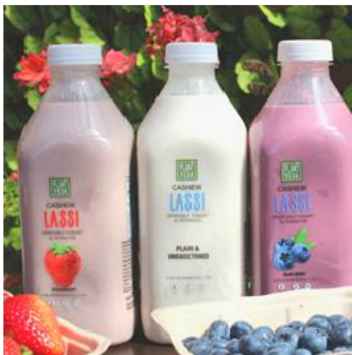
c) Cashew Milk

Plant Veda's cashew milk is a rich, creamy, slightly sweet tasting, light, wholesome cashew beverage made with simple, whole-food ingredients. The cashew milk blends a hint of herbs and spices such as saffron and cardamom as well as pistachio nuts, to create a healthy, dairy-free, cholesterol-free beverage with no added oils. The Company's cashew milk can be enjoyed over cereal, in different raw and cooked recipes or poured straight from the bottle.