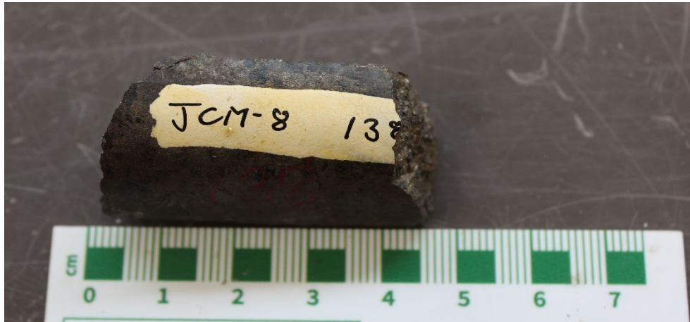
Figure 1 – Mal Lake Drillhole JCM-8 @ 138 feet (42.06m) split core, mineralized quartz diorite; pXRF scan @ 138.75 feet (42.29m): 21,146ppm Ni, 1,322ppm Cu, 1,480ppm Co; Note historic assay interval 38.98-43.19m in Table 1

A two-person Fathom crew reviewed, scanned available drill core with pXRF, Mag Susceptibility meter, took conductivity measurements, and photographed the drill core. Most of the Mal Lake drill core has been reduced to representative samples of a drillhole and is not complete/continuous original drill core (the entire drillhole) record. Fathom was reluctant to take samples for individual assays due to the now limited drillhole record. Nonetheless, a comprehensive database was collected and has provided significant data towards our understanding of the geology and metallogenesis of the Mal Lake occurrence and its relationship to the Gochager Lake deposit.