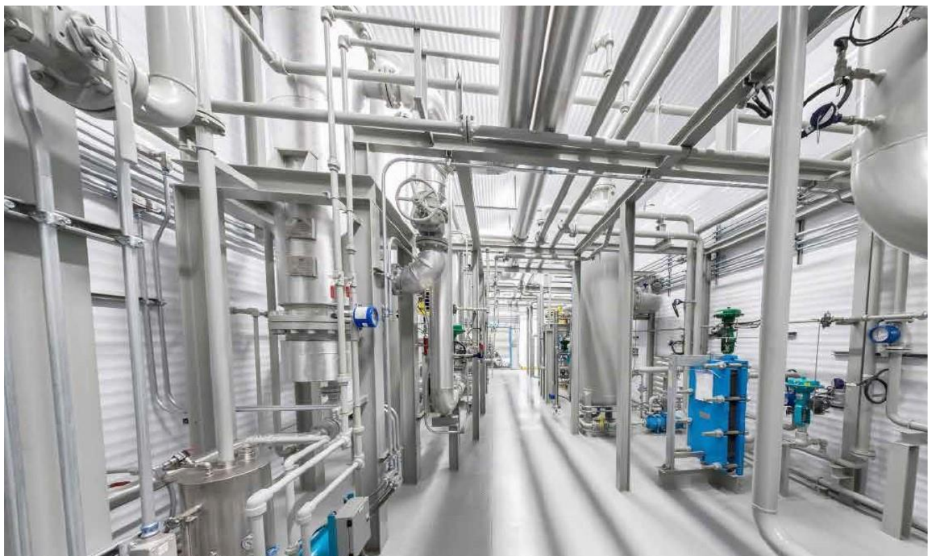
Modular designed CO2 capture unit, designed by Delta