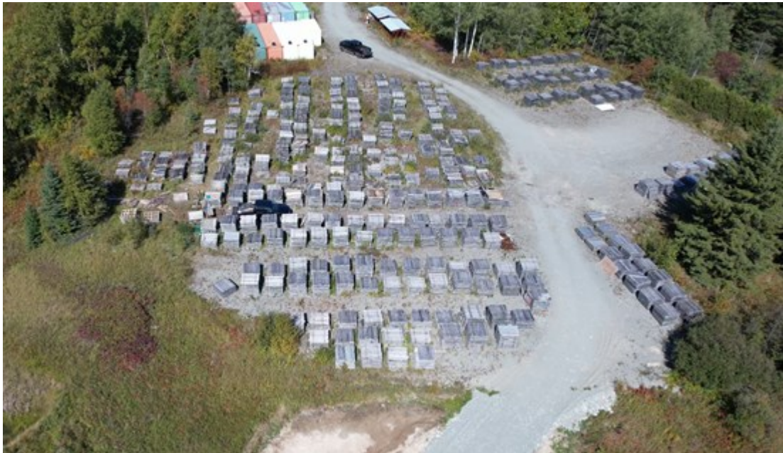
Image 3: Historical Core Library. Over 3,000 meters have been sampled related to the Phase 1 Open Pit Concept. Sampling continues.

To view an enhanced version of this graphic, please visit: