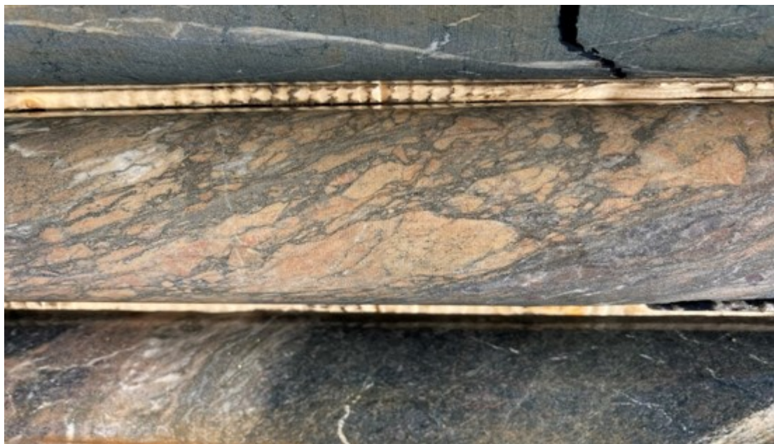
Image 2: Representation of mineralized and altered core from DQ23-09 (5.6 m of 7.5 g/t Au). Altered breccia zone in mafic volcanics; containing quartz veinlets, sericite, and ankerite.

https://images.newsfilecorp.com/files/8461/189569_f7600bcc34ad484d_001full.jpg