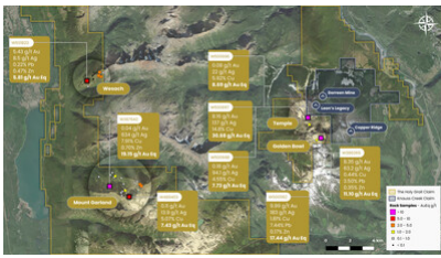
Figure 2: Best new values obtained on the Holy Grail during the summer 2023 field program.

Prospecting on the southern side of the Wesach mountain, uphill of the Wesach Creek, led to the discovery of many quartz veins bearing gold, silver, lead and zinc. Sample W501823 contains 5.43 g/t Au, 8.5 g/t Ag, 0.22% Pb and 0.47% Zn and sample W502285 contains 1.13 g/t Au, 102 g/t Ag, 3.27% Pb and 2.57% Zn. A cluster of mineralized samples covers an area of 400 m by 400 m. Some sampled erratic blocks returned copper, gold and silver values. The source has yet to be found.