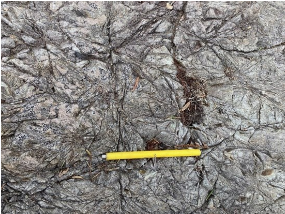
Figure 3 - Spinifex Texture in Thicker Komatiite Flow

Given the lack of outcrops in the eastern third of the property yet to be prospected, and the large number of conductors identified to be followed up, a more reconnaissance type exploration approach, such as a property wide soil sample survey, may be effective at identifying the prospective areas for more advanced target development work. This approach is supported by the results of a historic soil survey carried out in the southwest corner of the Gargoyle claim block which successfully identified elevated nickel concentrations over areas with mapped ultramafic rocks.