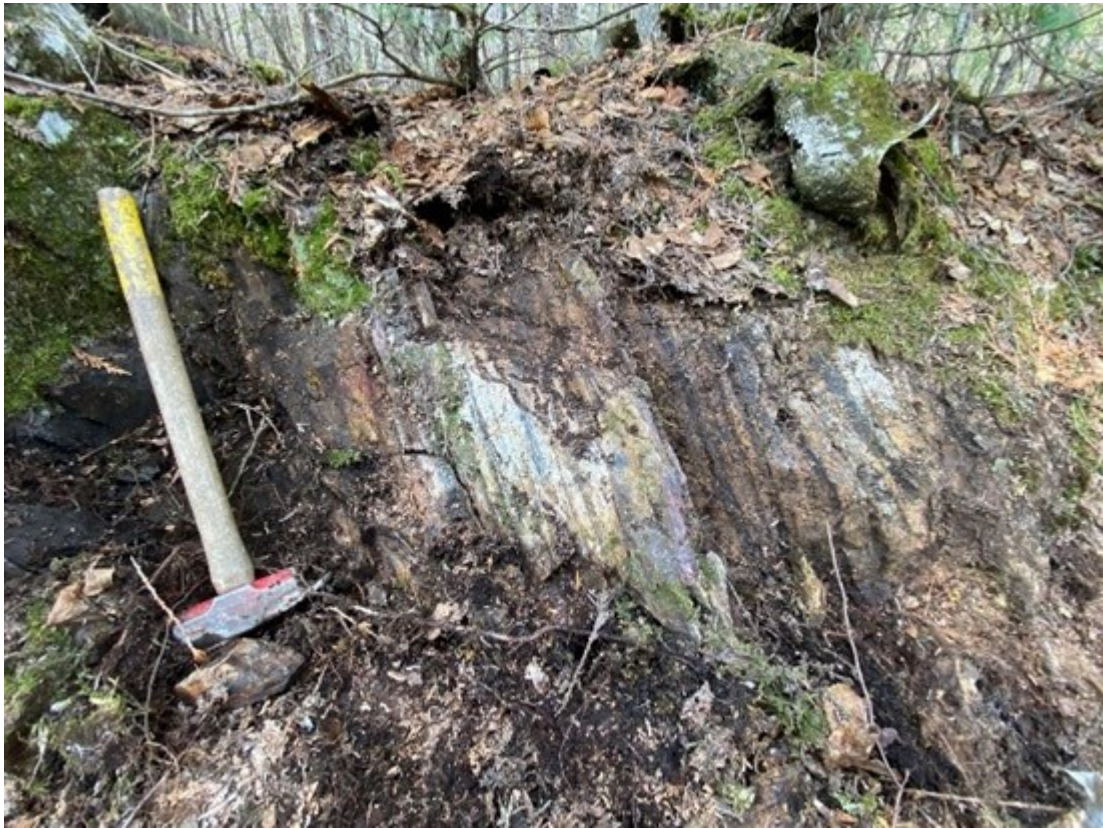
Figure 4 - Banded Iron Formation

To view an enhanced version of this graphic, please visit: