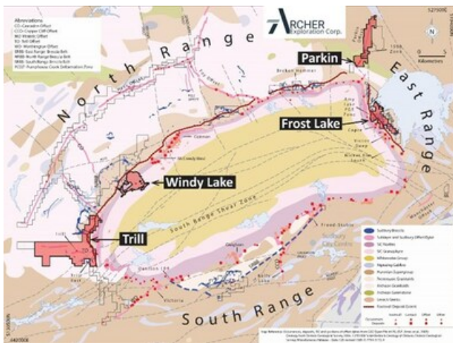
Figure 2: Geology map of the Sudbury Basin showing the location of Parkin, Frost Lake, Windy Lake and Trill.

The 2023 Sudbury exploration plan anticipates targeting Ni-Cu-PGM deposits related to the Sudbury Igneous complex (SIC) on the Parkin and Trill properties. A budget of C$2 million has been approved for exploration of the Sudbury land package.