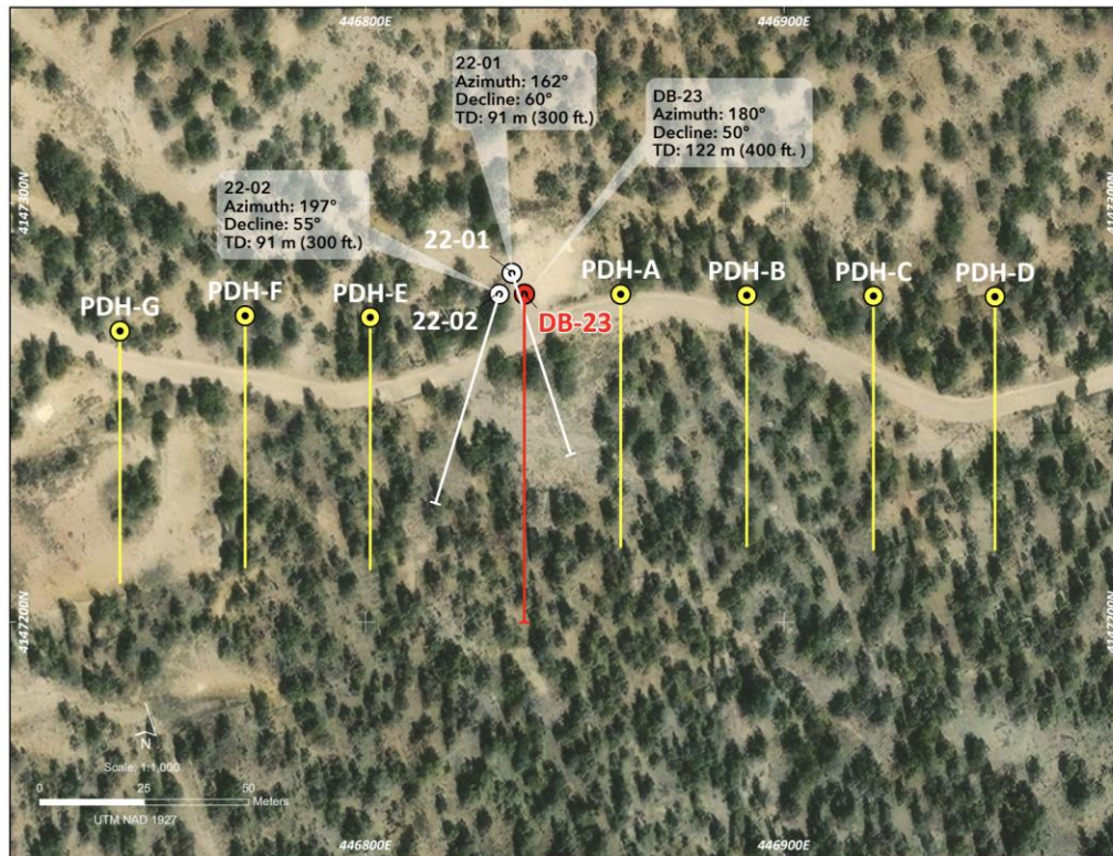
Figure 1. Map depicting discovery holes DB-23, 22-01 and 22-02 shown with proposed step-out Drill Hole locations.

Athena completed two RC drill programs in 2022 and intersected shallow high-grade oxide gold intervals which now comprise the Western Slope Zone. A review of our 2022 RC drill highlights is summarized below.