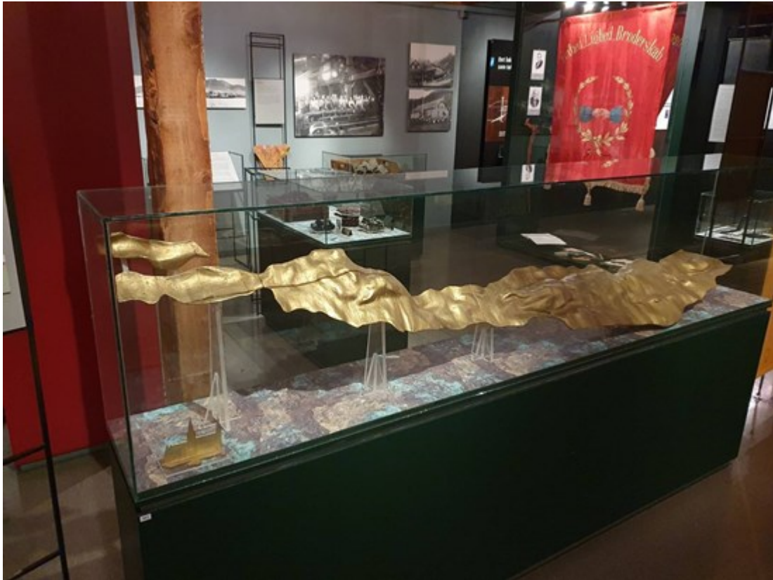
Picture 1: 3D model of Lokken (looking from East - the shallowest part - to the West - the deepest part

Teako's claims at Lomunda are contiguous to Capella Minerals Ltd (TSX.V: CMIL) claims which cover the former Løkken mine, placing the Company in an advantageous position to explore potential extensions of this prolific deposit. Similarly, the Venna project is located within the same mineral belt northeast of Løkken and presents a promising opportunity for discovering new deposits.