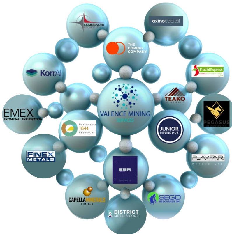
Illustration 1 - Current Service Alliance Members: