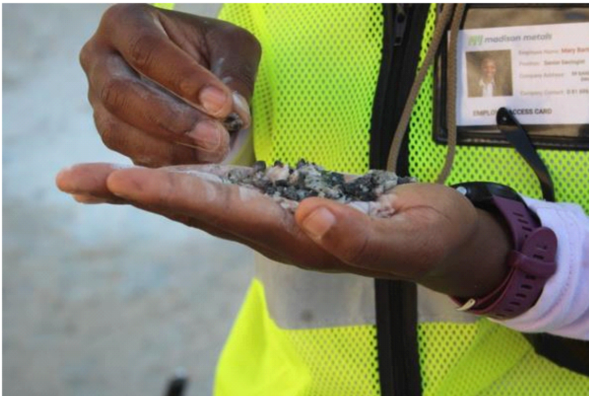
Photo 2: Work underway at Madison's Khan Uranium Project, Namibia. May 22, 2024.