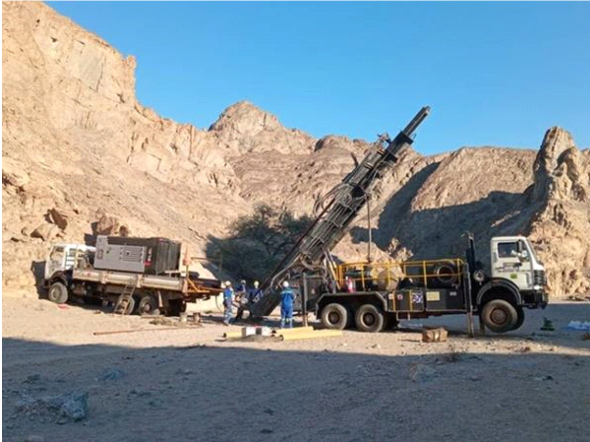
Photo 1: Work underway at Madison’s Khan Uranium Project, Namibia. May 22, 2024.

TORONTO, May 22, 2024 -- Madison Metals Inc. (“Madison” or the “Company”) (CSE: GREN) (OTCQB: MMTLF) (FSE: 4EF0) is pleased to announce that the maiden 2024 drill program has commenced at the Company’s Khan Project at Madison West , located in Namibia’s highly prospective Erongo uranium province.