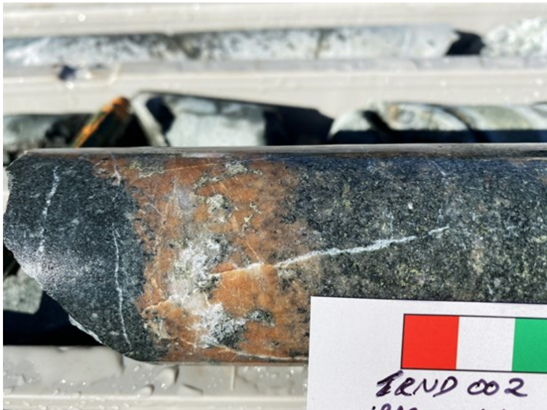
Figure 4: Photo of core from TRNDH002 (196.80m) showing pervasively chlorite-magnetite altered basalt with a crosscutting orange albite-quartz-carbonate-epidote-chlorite-pyrite-chalcopyrite vein.

To view an enhanced version of Figure 4, please visit: