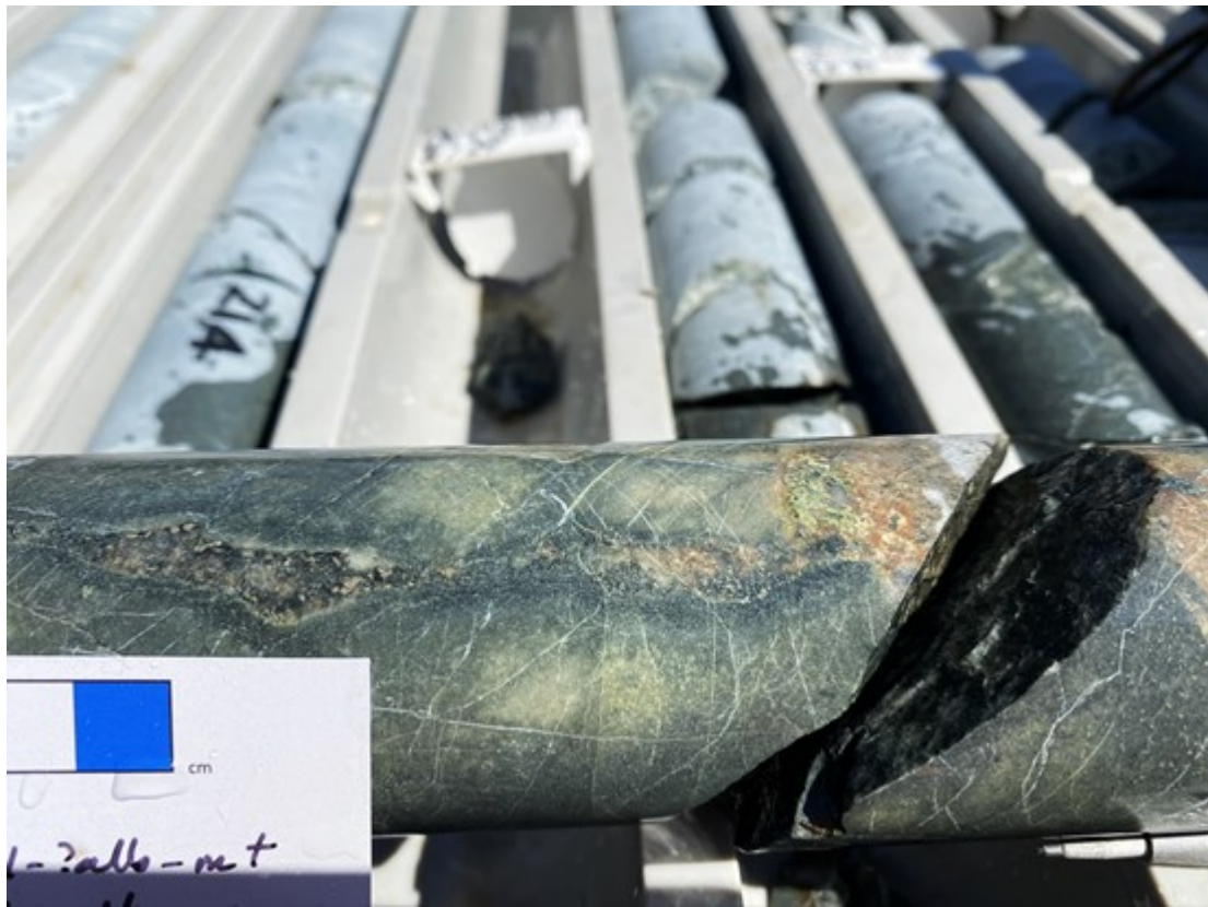
Figure 2: Photo of drill core from TRNDH002 (213.30m) showing complex multiphase alteration and veining associations. Early pervasive chlorite-albite-magnetite alteration overprinted by strong albite-epidote alteration further crosscut by complex quartz-epidote-albite-magnetite-chlorite-pyrite-chalcopyrite veins.

To view an enhanced version of Figure 2, please visit: