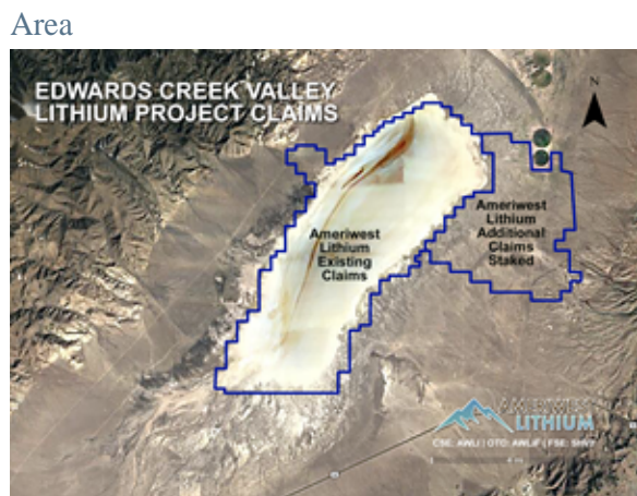
Figure 1: Ameriwest Lithium Edwards Creek Valley Claim Area