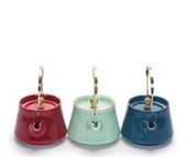
The Vitality Tea Pot $49.99 USD

Mugs, Shirt and Accessories: The Company sells assorted tea accessories which are sold via drop shipping arrangements with third party vendors which does not require the Company to carry any inventory or commit to any sales until the product is purchased by the consumer. During the period ended September 30, 2019, these products represented 100% of the Company's revenues. Examples are below: