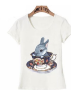
The Cute Bunny Tea Shirt $24.99 USD