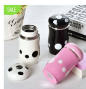
Mini Mushroom Portable Travel Mug $29.99 USD $34.99 USD