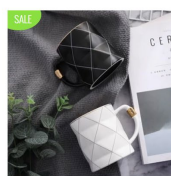
The Nordic Tea Mug $24.99 USD $29.99 USD