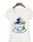
The Great Japanese Tea Shirt $24.99 USD