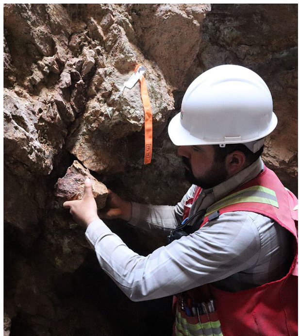
Photos 1 and 2: Sample 161 and where it was taken within the Hueco Grande historical working.