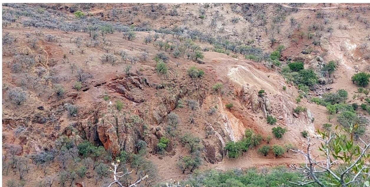
Figure 2: Nora property looking north at the main outcrop of the Candy vein structure.

Silver Dollar can acquire a 100% interest in the Nora property under an option agreement with Canasil Resources Inc. Situated in the Eastern Sierra Madre sub-province, in the transition to the high plateau of Mexico, the Property lies centrally within the "Silver Trend" that runs from the northwest to the southeast through Durango State. Significant deposits in the region include Endeavour Silver's Guanaceví mine and Fresnillo's San Julián mine on-trend to the northwest, with Endeavour Silver's Pitarrilla Project approximately 50 kilometres (km) to the east. Pitarrilla is one of the largest undeveloped silver deposits in the world and was discovered by Perry Durning and Frank (Bud) Hillemeier, who serve as Silver Dollar's technical advisors.