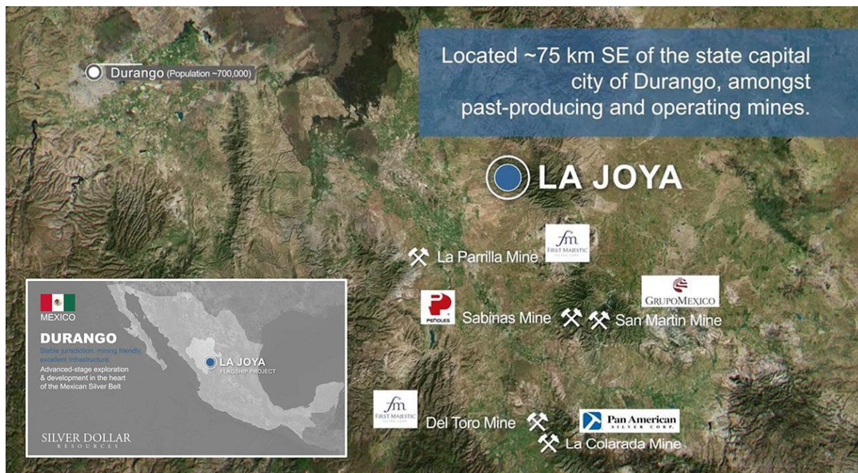
Figure 1: Location of the La Joya Project along with past-producing and operating mines in the area.

VANCOUVER, BC – May 25, 2023 – Silver Dollar Resources Inc. (CSE: SLV) (OTCQX: SLVDF) (FSE: 4YW) (“Silver Dollar” or the “Company”) is pleased to announce that, further to its news release of April 11, 2023 , it has completed the exercise of its option and now owns a 100% interest in its La Joya silver-copper-gold property (the “Property”).