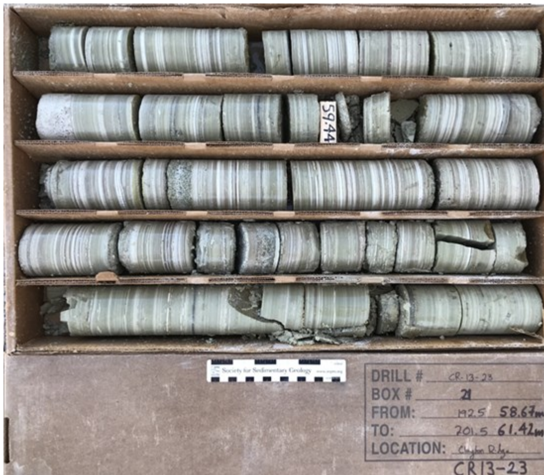
Figure 3. Photo of claystone interval containing 973 ppm Li between 58.7 to 61.42 meters in Hole No. CR13-23.

To view an enhanced version of this graphic, please visit: