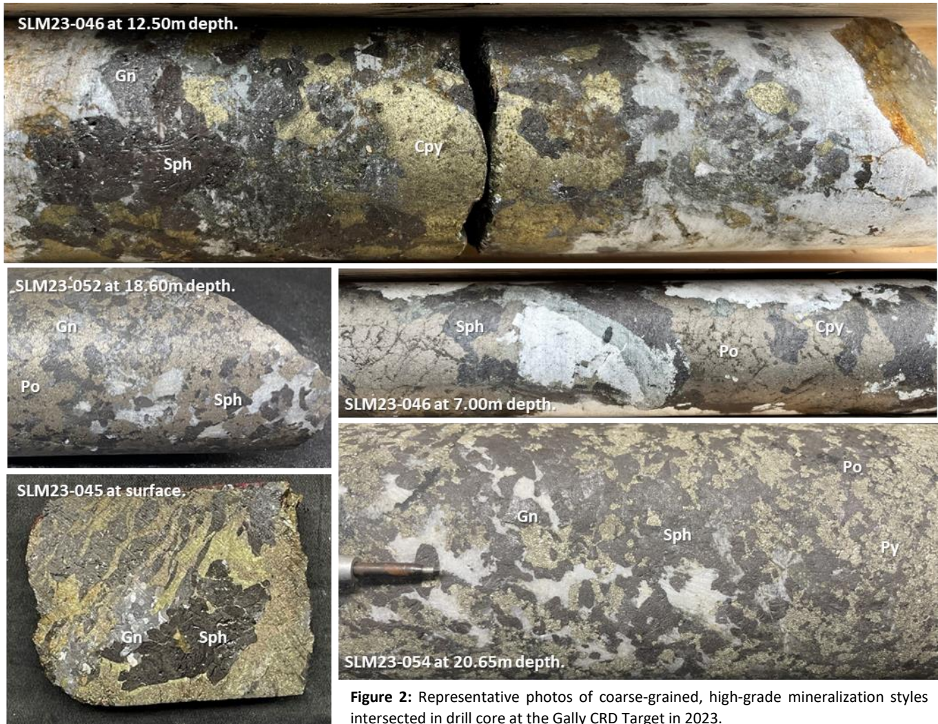
Figure 2: Representative photos of coarse-grained, high-grade mineralization styles intersected in drill core at the Gally CRD Target in 2023.