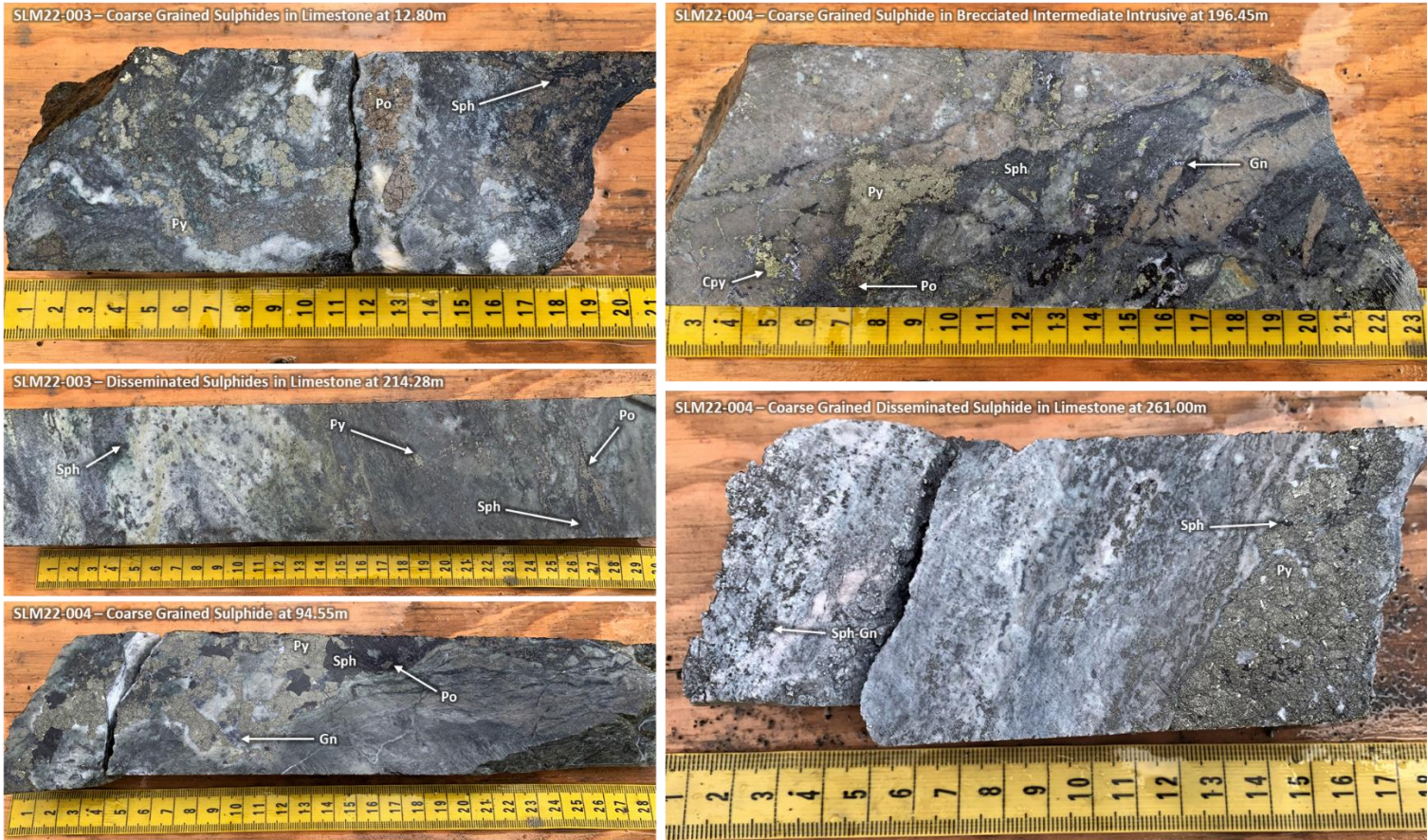
Figure 2: Photographs of representative 2022 HQ-sized core intervals from SLM22-003 and SLM22-004 of base metal sulphide (Chalcopyrite = Cpy; Galena = Gn; Sphalerite = Sph; Pyrrhotite = Po; Pyrite = Py) occurrences at the Jackie Target, Silver Lime Project.