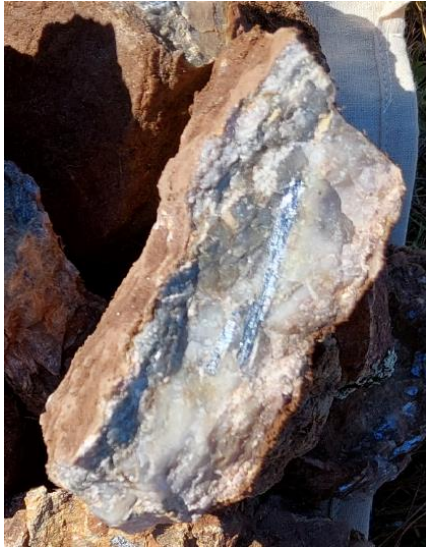
Figure 5: Coarse quartz vein containing columnar stibnite, sample R00327 assay pending, McDonalds Prospect North.