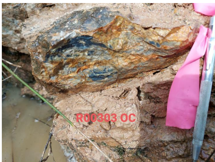
Figure 4: Hydrothermal alteration on metasediment contact, McDonalds Prospect North.