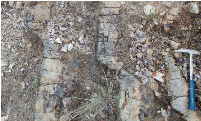
Figure 6: Outcrop showing sinistral offset, McDonalds Prospect South.