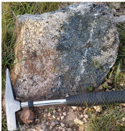
Figure 3: White quartz and tourmaline veins cutting the greisen-altered granite, Arthurs Seat, New South Wales.