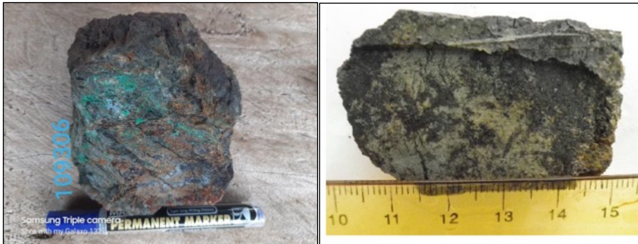
Figure 3: Mineralized rock float samples at Everi Creek. Left: Sample #109306 which is an ultramafic rock with strong malachite coatings and veins of quartz, pyrite and chalcopyrite assaying 2.88% Cu, 0.328 g/t Au, 4.4 g/t Ag and 1 ppm Mo. Right: Sample #109307 which is a clinopyroxene-rich Cu-Au skarn with assay values of 0.9% Cu and 0.21 g/t Au. See Figure 2 for location.