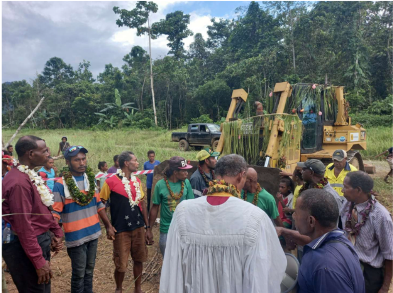
Figure 4: Ground-breaking celebration for construction of the 30 km access road to the drill site and camp. Local Doma Village residents shared in the excitement of developing this new infrastructure.