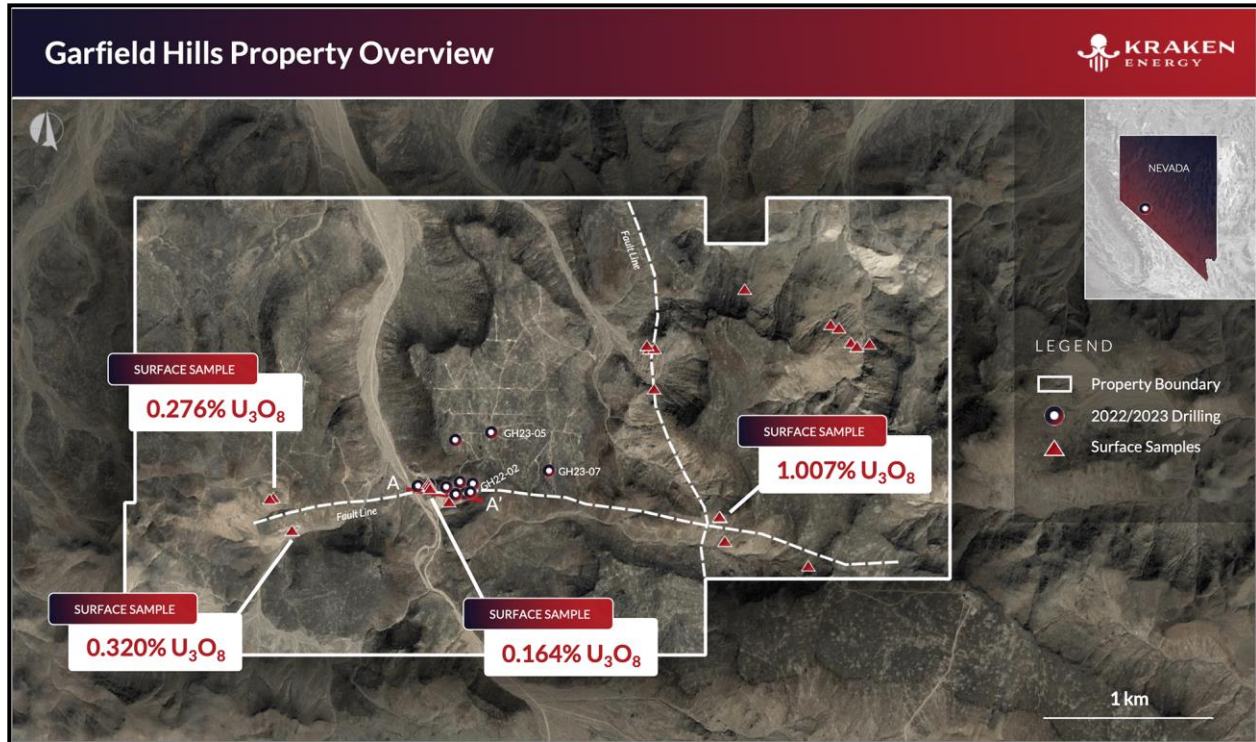
Figure 1: Phase 1 Drill Program Plan Map