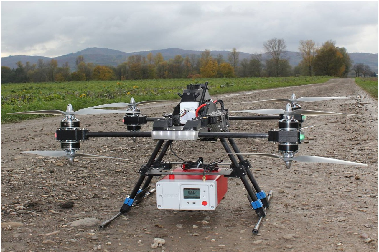
Figure 1. Example of D230A UAV Gamma-Ray Spectrometer Used for Collecting Radiometric Data

The UAV survey, which is expected to commence in June, is a leading-edge drone technology that produces high-resolution data critical for identifying the geophysical signature of known uranium mineralization and for discovering new zones of uranium mineralization. It will cover the Apex Mine area, as well as the newly acquired land package surrounding the mine, which includes multiple historic uranium showings.