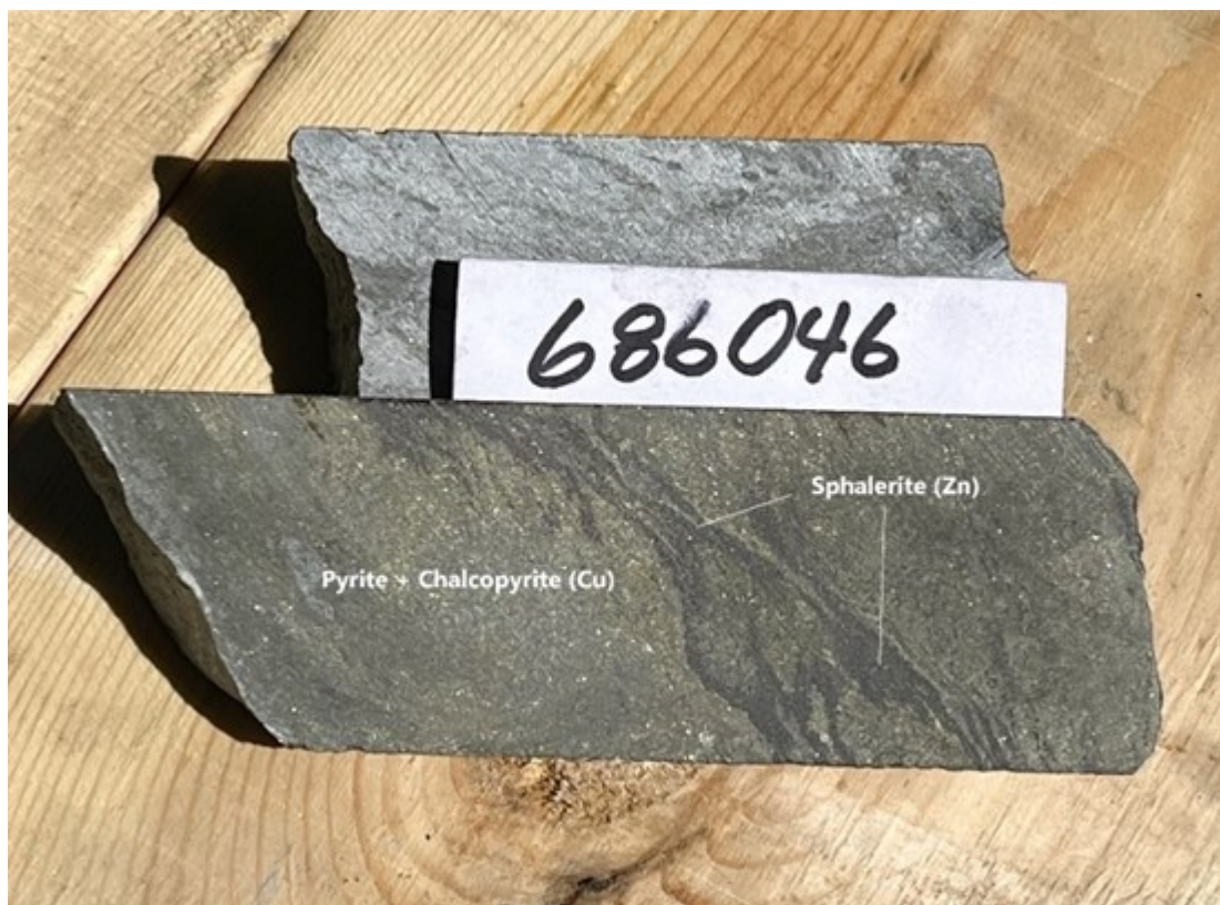
Figure 1: Sample #686046 (Zone 2) - Sphalerite & Chalcopyrite Bands, (1.6% Cu, 2.08% Pb-Zn, 19 g/t Ag, .54 g/t Au)

To view an enhanced version of this graphic, please visit: