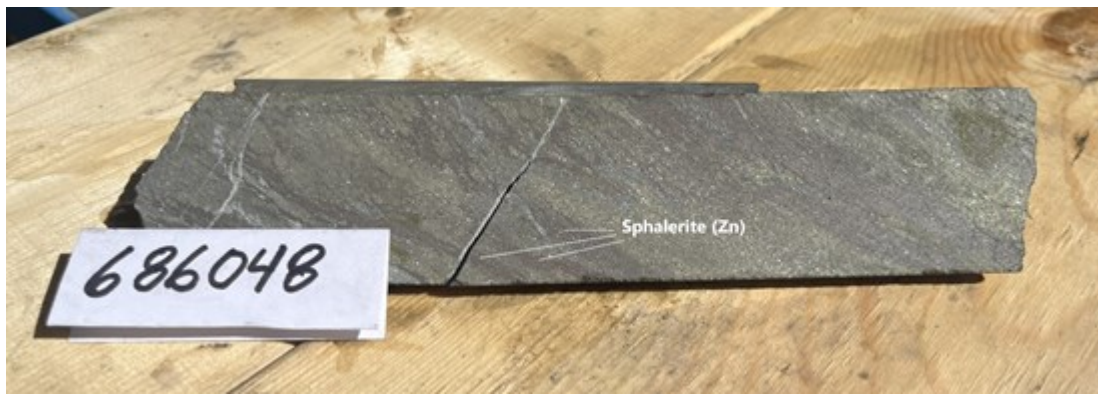
Figure 2: Sample #686048 (Zone 2) - Sphalerite Bands within VMS, (1.09% Cu, 20.37% Pb-Zn, 51 g/t Ag, .78 g/t Au)

To view an enhanced version of this graphic, please visit: