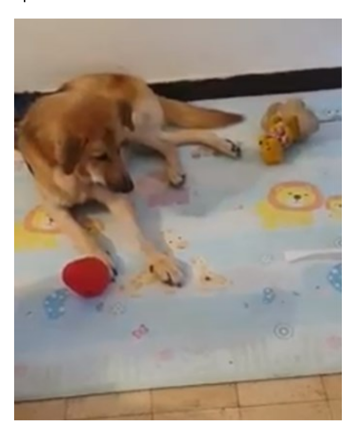
Figure 1 Goody before LPT injection

Herzliya, Israel and Calgary, Alberta--(Newsfile Corp. - June 24, 2022) - Innocan Pharma Corporation (CSE: INNO) (FSE: IP4) (OTCQB: INNPF) (the "Company" or "Innocan") is pleased to announce successful preclinical trials in dogs with osteoarthritis. A case entailing the clinical condition of Goody, an 8-year-old male mixed-breed dog, who was rescued in a terrible condition after he was found tied up with a very short leash, cachectic and wounded, was published. Goody suffers from severe osteoarthritis in most of his joints, and severe muscle atrophy, mostly surrounding the pelvic limbs. Goody was already treated with joint supplements, non-steroidal anti-inflammatory drugs, and hydrotherapy. The liposomal CBD was administered on top of these treatments.