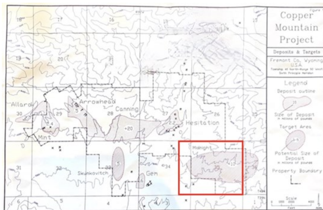
Figure 2: Midnight claims (red rectangle) on a map from a 1991 Anaconda report indicating the Midnight Prospect, which potentially contains up to 10 Mlbs eU 3 O 8 . (Confidential information redacted.)

Initial drilling by RME intercepted trace to very low-grade mineralization; however only a very small portion of the Midnight Fault zone has been tested. The structural preparation, oxidation/alteration profile and presence of adequate reductant should be considered favourable elements for Canning-type mineralization, which RME concluded could represent a target of up to 10 million pounds eU 3 O 8 .