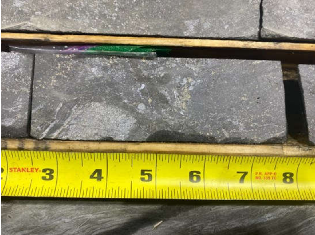
Image 2: BR-21-06, small section of the mineralized zone. Host wallrock fragment in bottom left (greyish angular fragment), massive rounded magnetite on the right, pyrite is easily seen throughout, the black angular mineral in the middle is chlorite.

To view an enhanced version of Image 2, please visit: https://orders.newsfilecorp.com/files/8422/111439_8faf8652740a58ce_002full.jpg