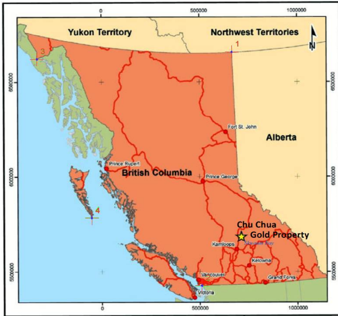
Figure 1. Location of Chu Chua Gold Property

for example, Table 1), and email confirmation of the transaction and title. MTO also provides GPS coordinates for the four corners of each cell in a claim.