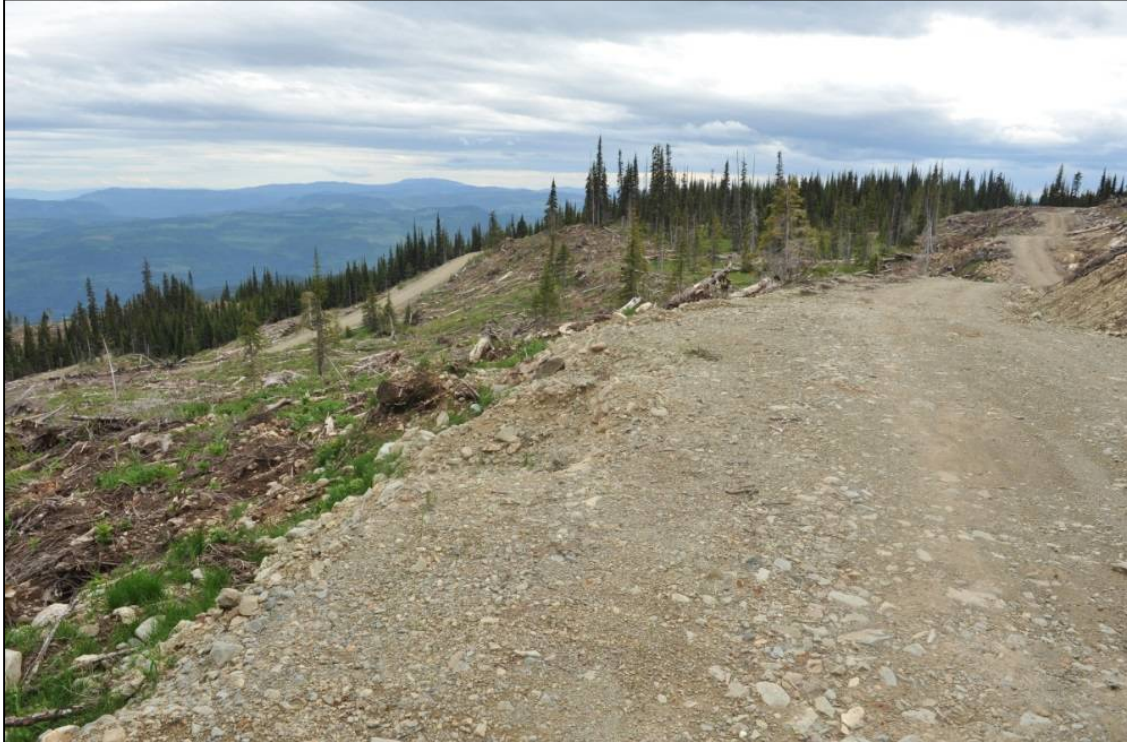
Figure 3. The Property is a patch-work quilt of logging clear-cuts laced with haul roads and skidder trails. Logging has improved access and the number and extent of bedrock exposures