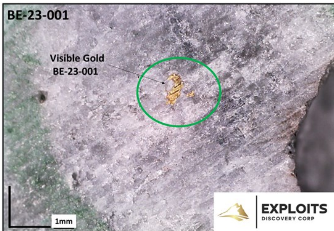
Figure 3: Example of the free distribution of Visible Gold observed at 61 m downhole in drill hole BE-23-001.

To view an enhanced version of this graphic, please visit: