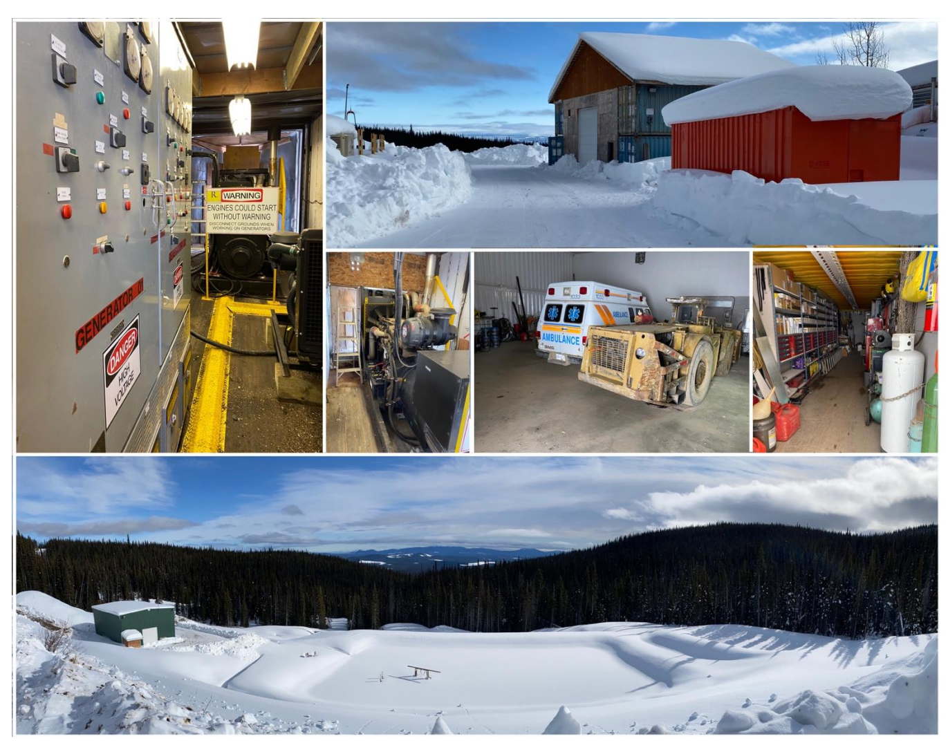
Dome Mountain Mine is efficiently designed and well maintained.